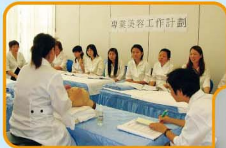
美容師上課時的情況 Beauticians attending lessons

Christian Family Service Centre - Lai Chi Centre