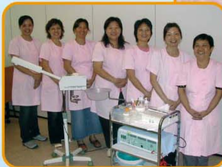
充滿自信的美容師 Beauticians are full of confidence