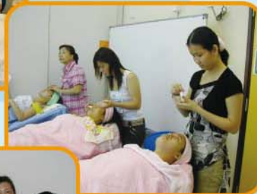
邊學邊試 Learn and practise