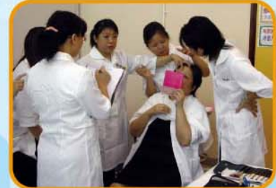
導師示範正確方法 A demonstration by the tutor.